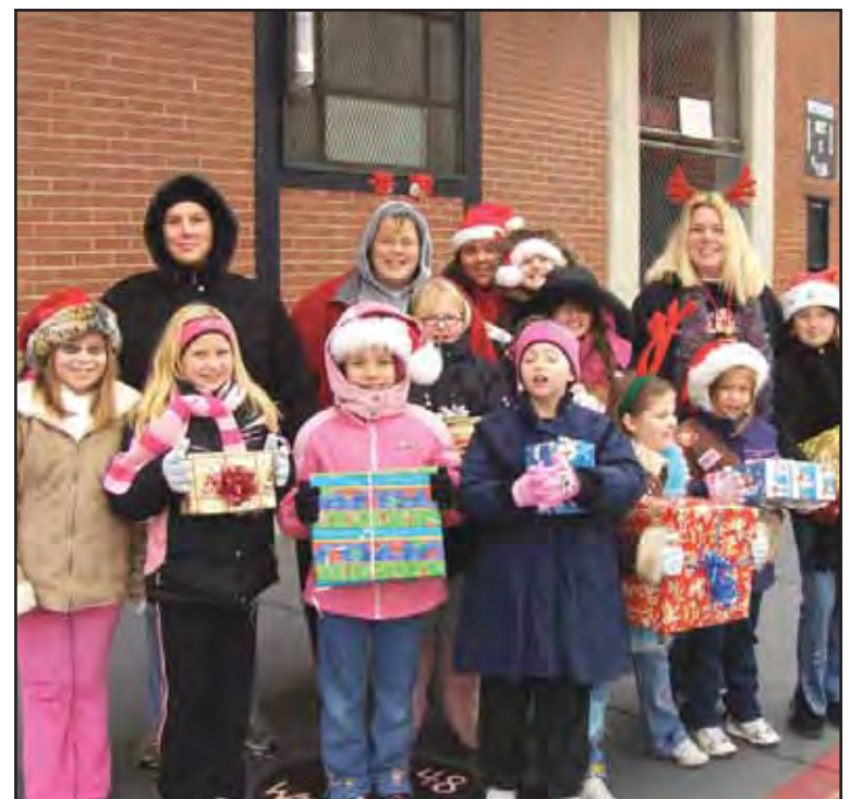
Charleroi Girl Scouts braved the cold to participate in Santa's parade.