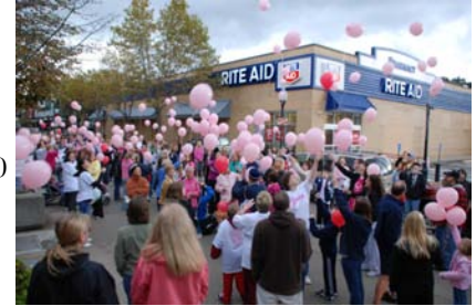
A balloon release was part of the 2009 festivities.

7 th Annual Lois Orange Ducoeur Breast Cancer Walk will take place on Saturday, October 9. Registration begins at 8:30 am – walk starts at 10:00 am. There will be NO pre-registration . The 1 st 150 walkers registering the day of the event with a minimum donation of $20 will receive a FREE tote bag.