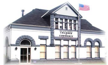
"25 Largest Chambers In The Pittsburgh Region"