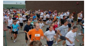
Runners at the 2008 event.

The Little Great Race Committee has been hard at work preparing for this year’s event which will take place at Charleroi Community Park on Saturday, September 11th.